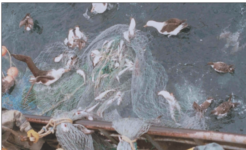
Figure 5. Seabird–fisheries interactions off the coast of Argentina. Some current fishing practices lead to high seabird mortality.

In addition, we must address the fundamental problem of overcapitalization in the world’s fisheries and establish governance structures that provide incentives for fishermen (eg via property rights) to promote conservation and sustainable fishing of portfolios of species (Edwards et al. 2004; Hilborn et al. 2004). Finally, it is critical to recognize that impacts of fishing do not act in isolation, even in populations for which overexploitation is the primary threat. Habitat degradation, pollution, and invasive species interact with disease, climate change, and other stressors to exacerbate existing problems in many populations. An effective conservation program for the oceans must address the threats on all fronts.