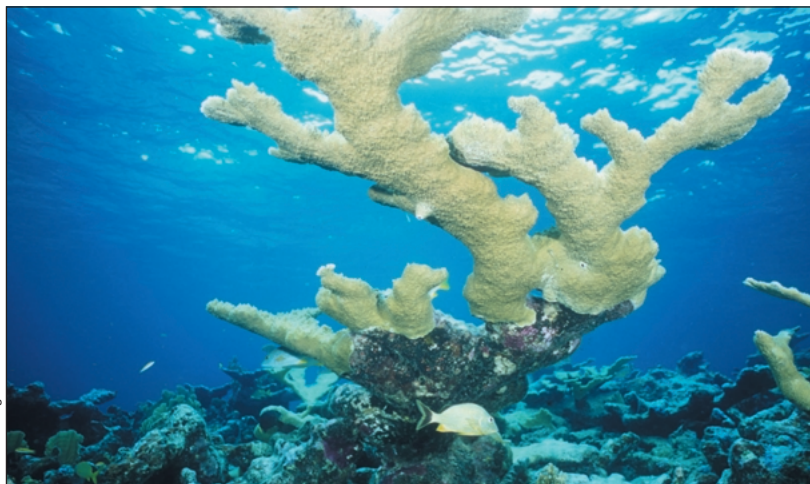
Figure 4. Acropora palmata , commonly known as elkhorn coral, in the Bahamas. A. palmata , which once formed dense stands, has declined precipitously throughout the Caribbean and is now listed as a candidate species under the ESA, along with Acropora cervicornis and Acropora prolifera .

The consequences of marine extinctions will remain a black box until more is known about the natural histories, interactions, and