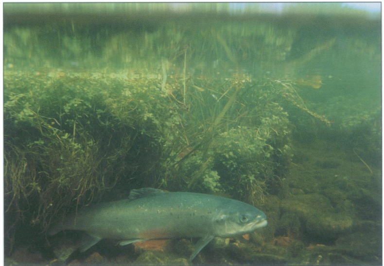
Figure 5. Wild Atlantic salmon.

Producing a kilogram of salmon releases approximately 0.02 to 0.03 kg of N, excluding losses from uneaten feed (Brooks and Mahnken 2003). About 70 000 mt of salmon were produced in British Columbia in 2003 (C Matthews pers comm) with a gross domestic product value of C$91 million, or approximately US$66 million (Marshall